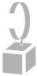
Jewelry display stand