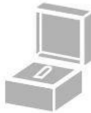
Jewelry Display Stands