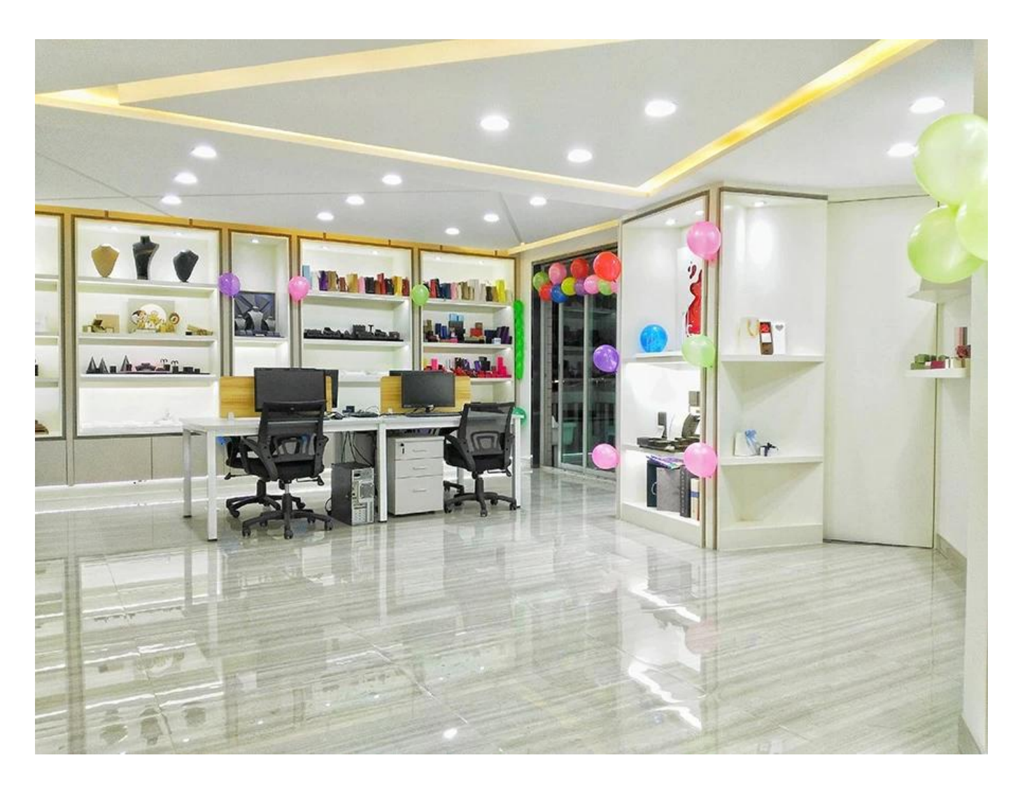
Our Exhibition []