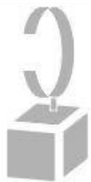
Jewelry display stand