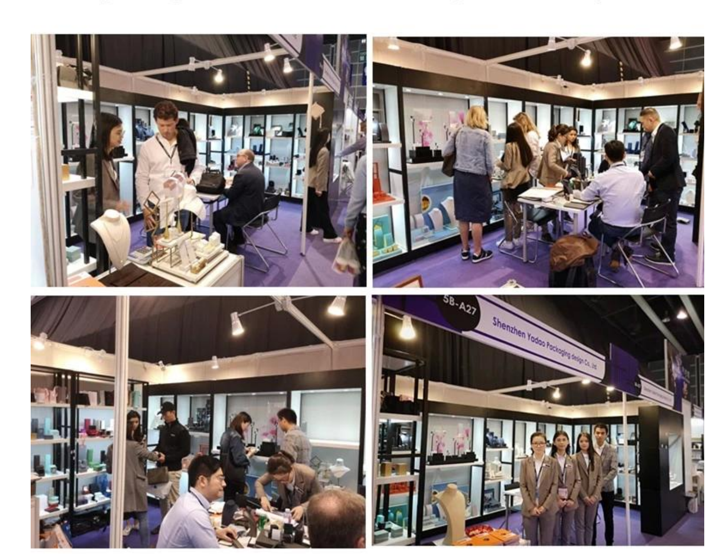
2019 Hongkong international jewellery show