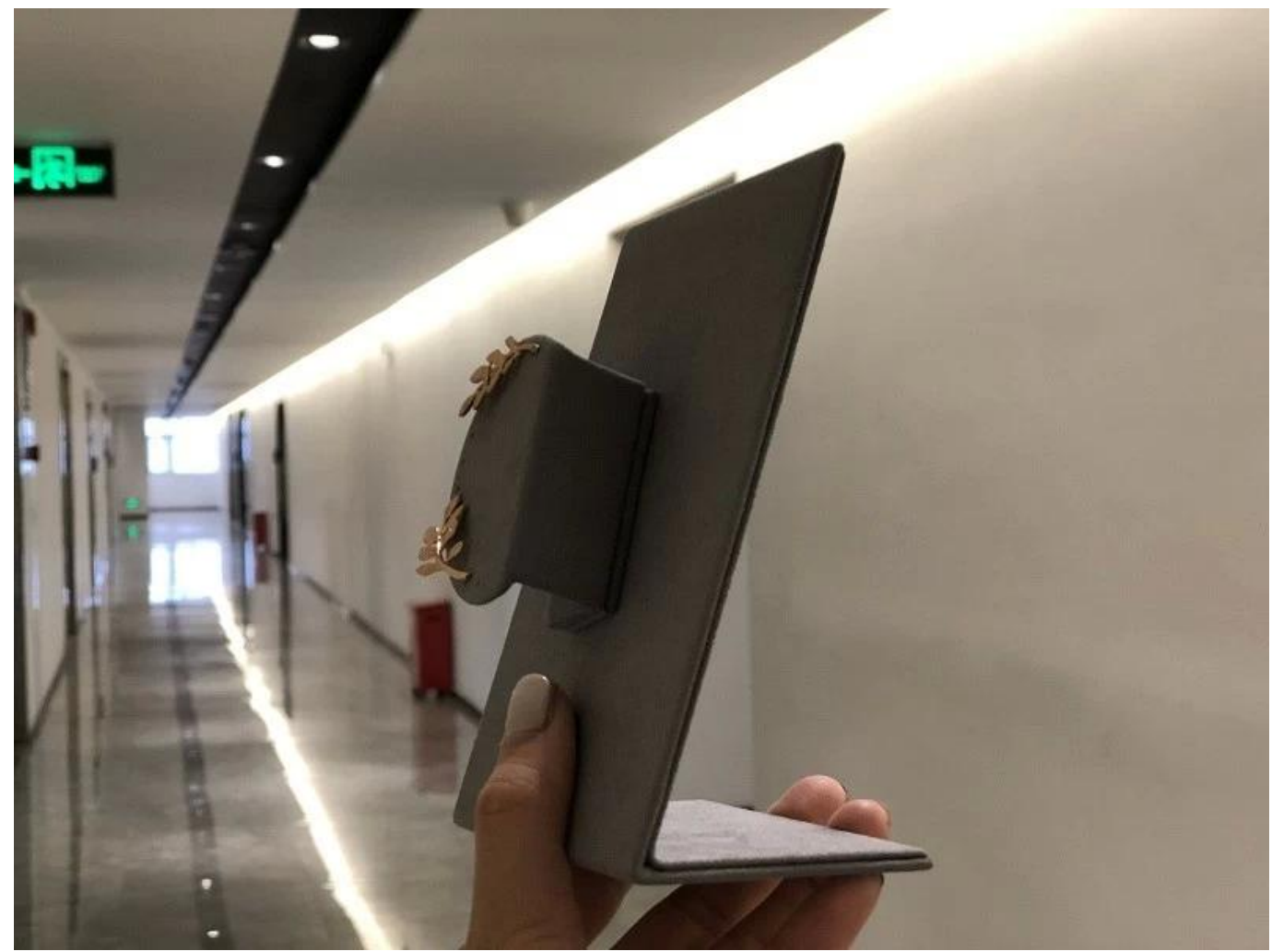
Other products that may interest you: