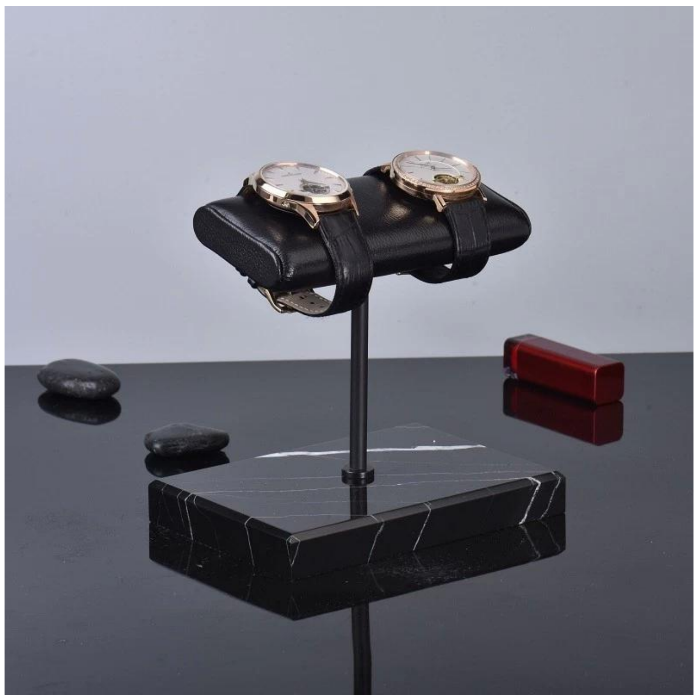
Other Products That May Interest You: