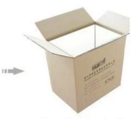
Carton with foam Inside