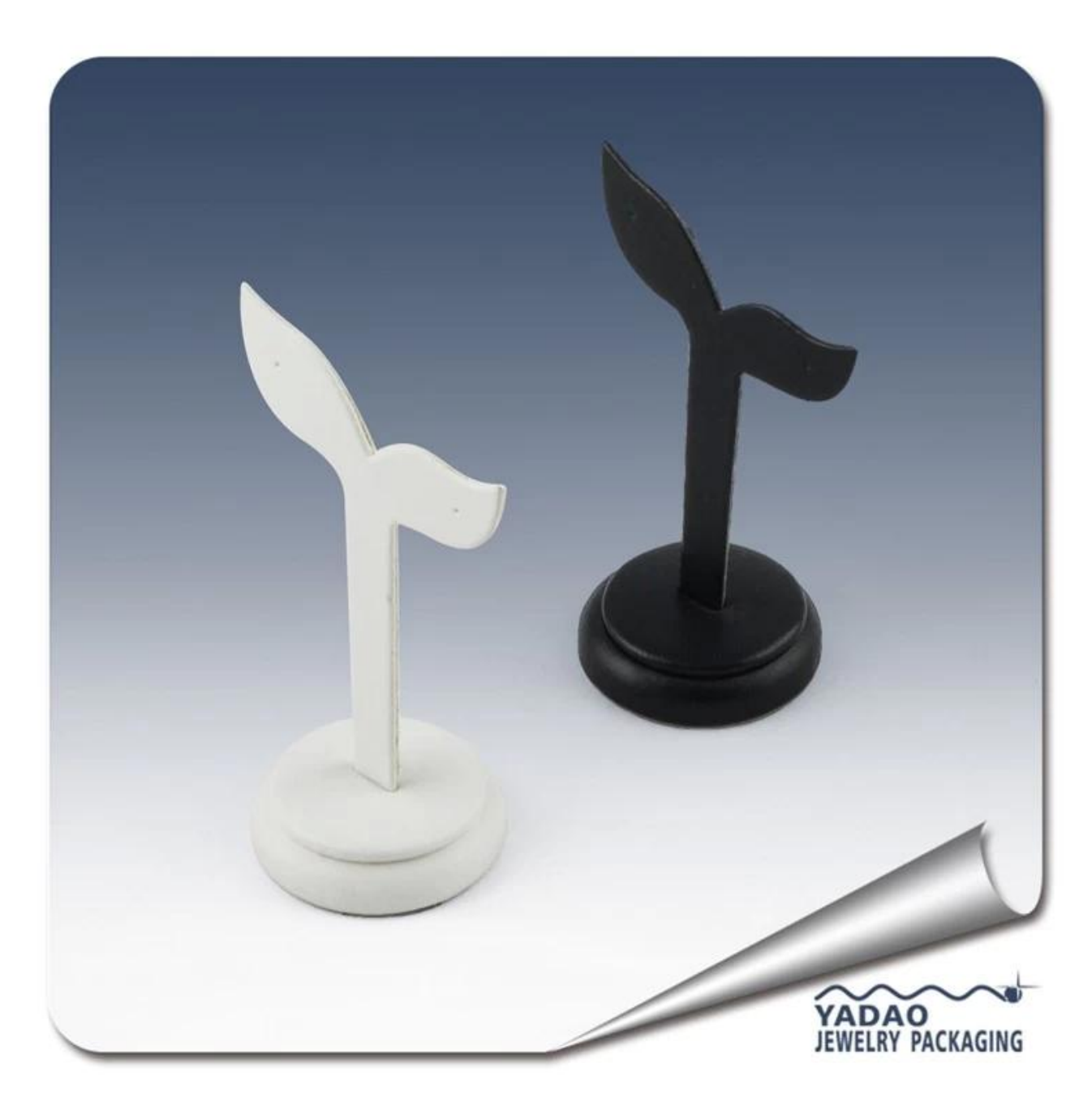
More Products for you reference