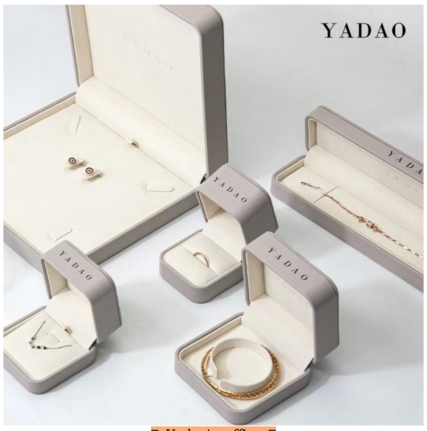
☐ Yadao's office ☐