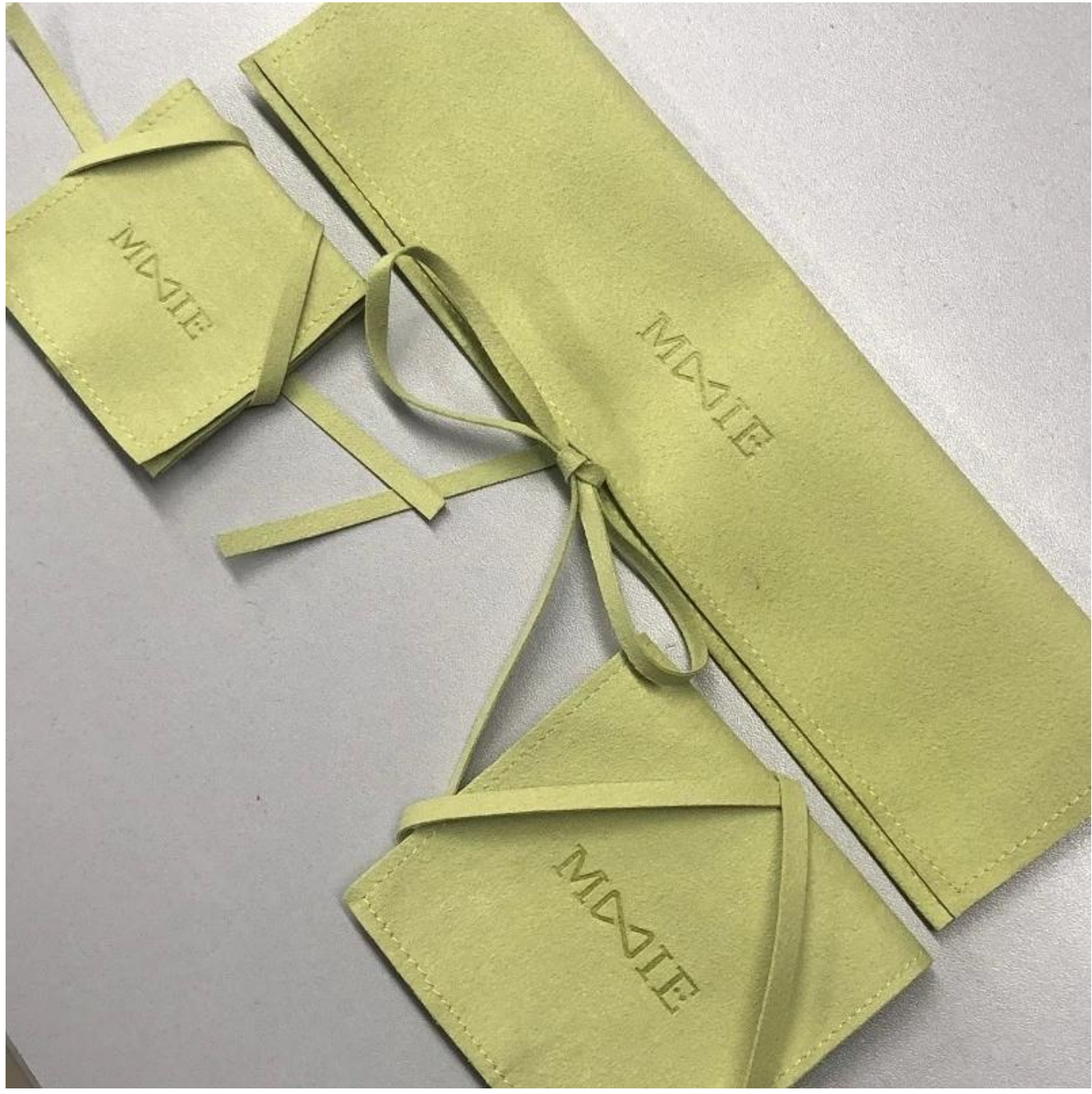
Other products that may interest you: