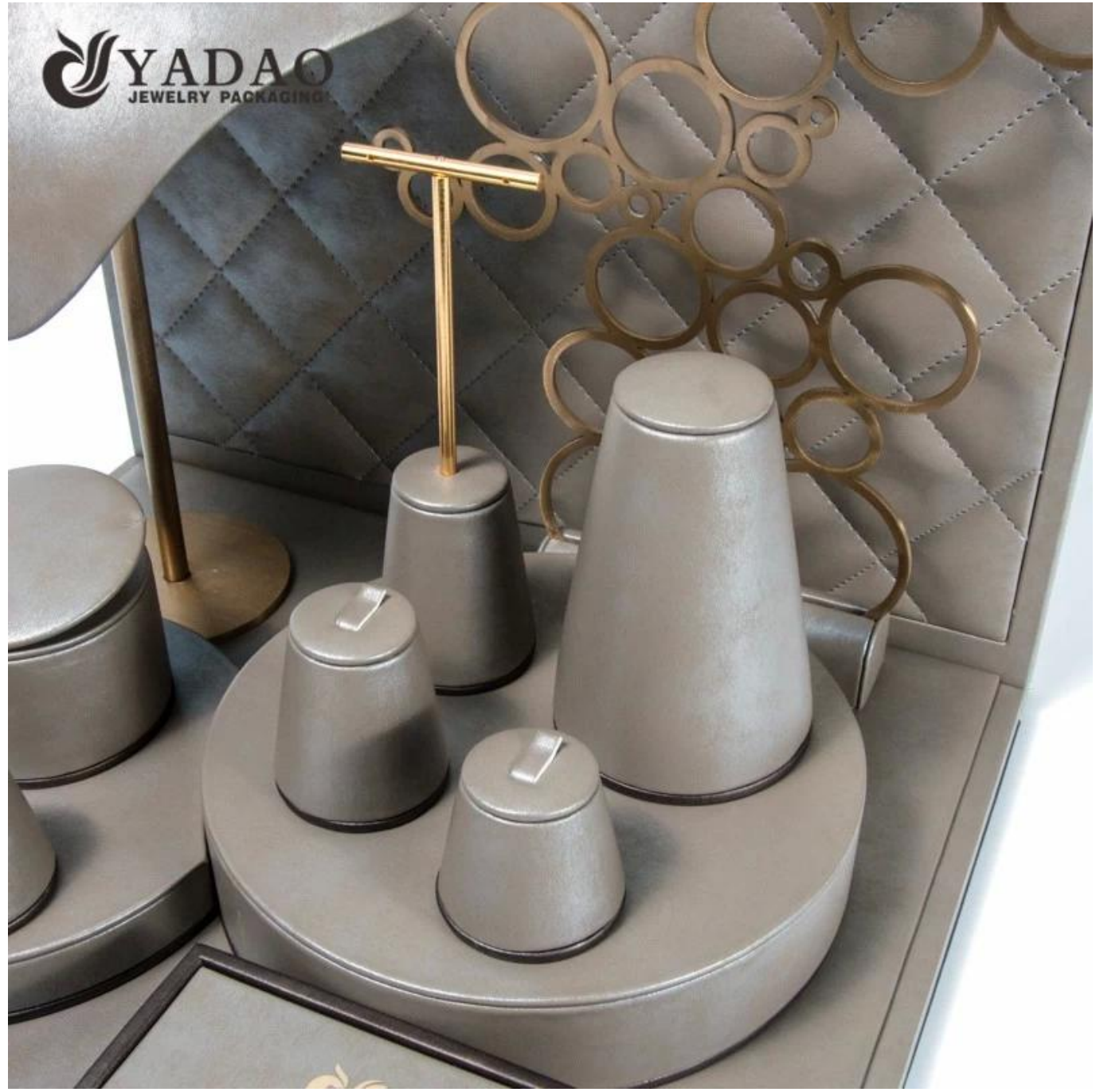
Other products that may interest you: