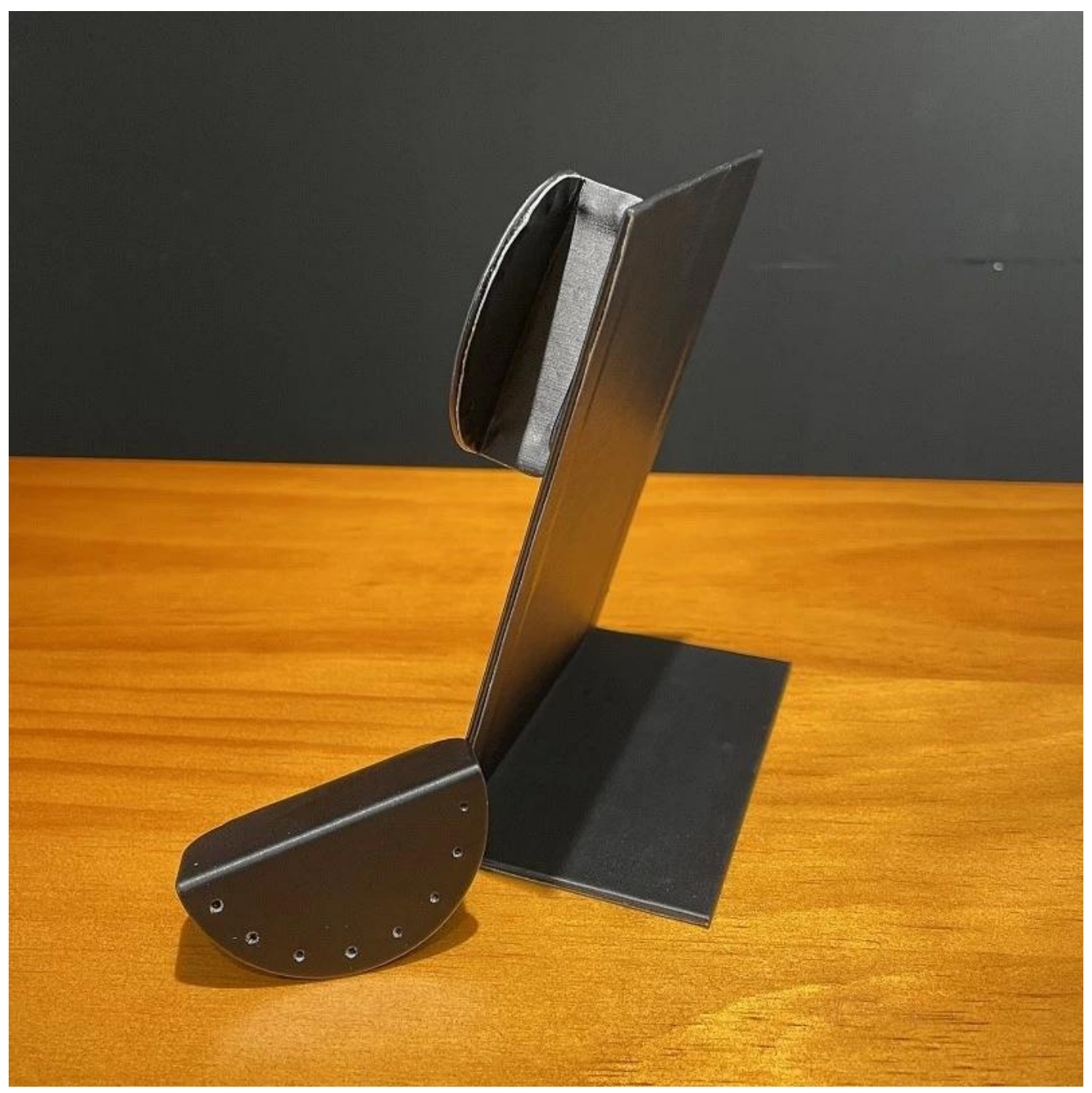
Other products that may interest you: