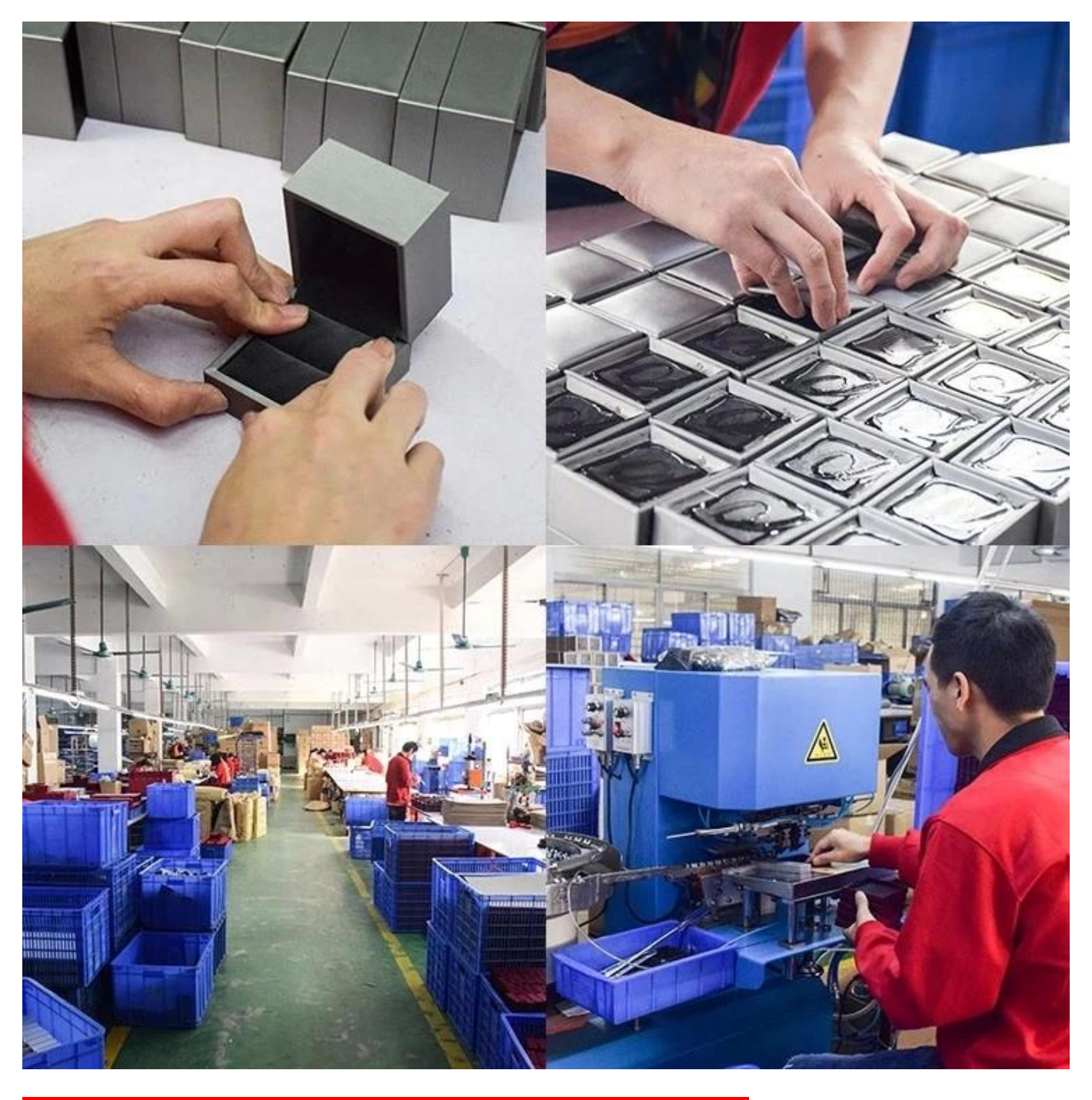
Other products you may be interested in: