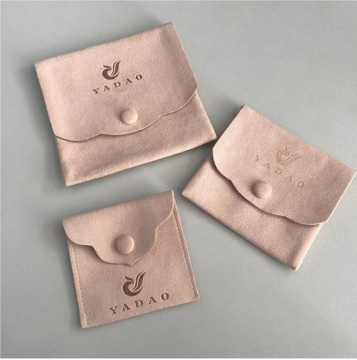
Other products that may interest you: