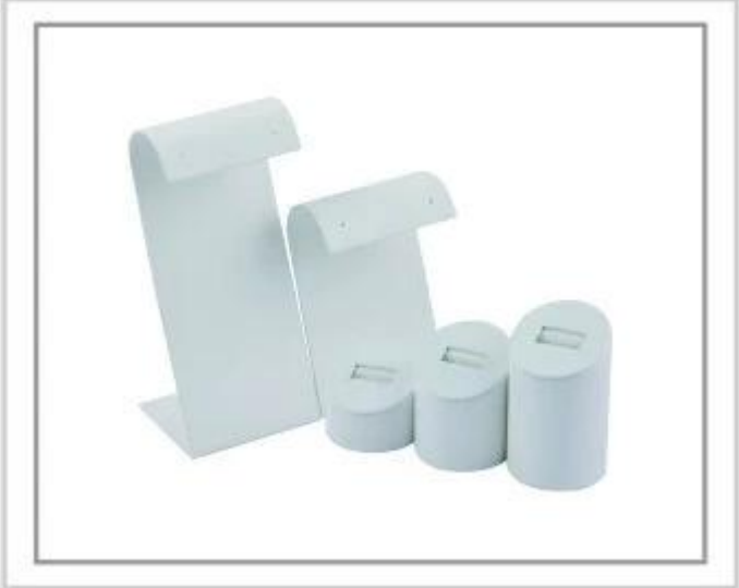
Jewelry Display Stands