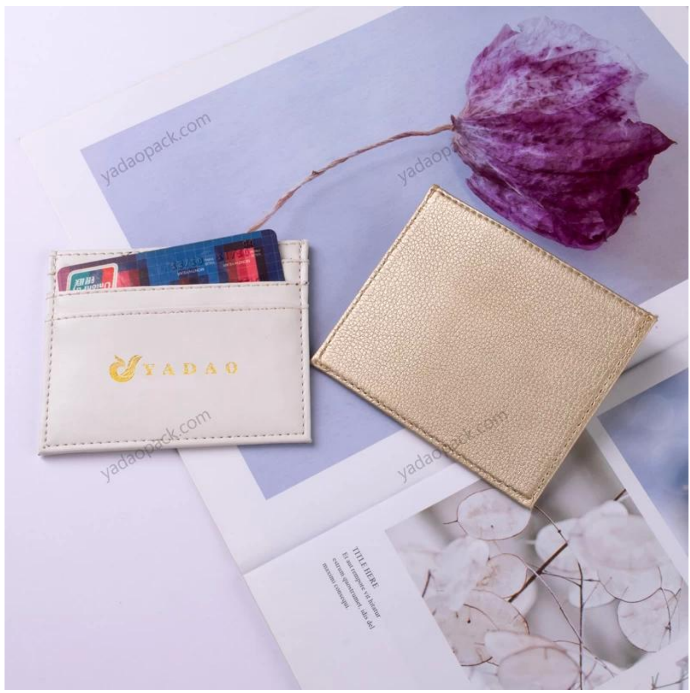
Other products that may interest you: