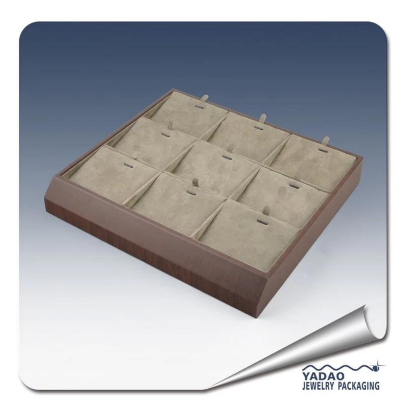
Other products you may interested in: