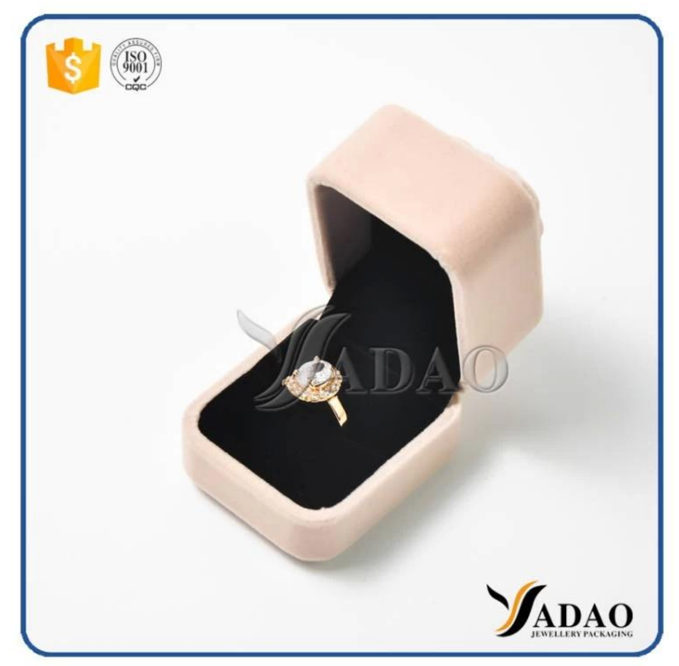
Other products you may interested in: