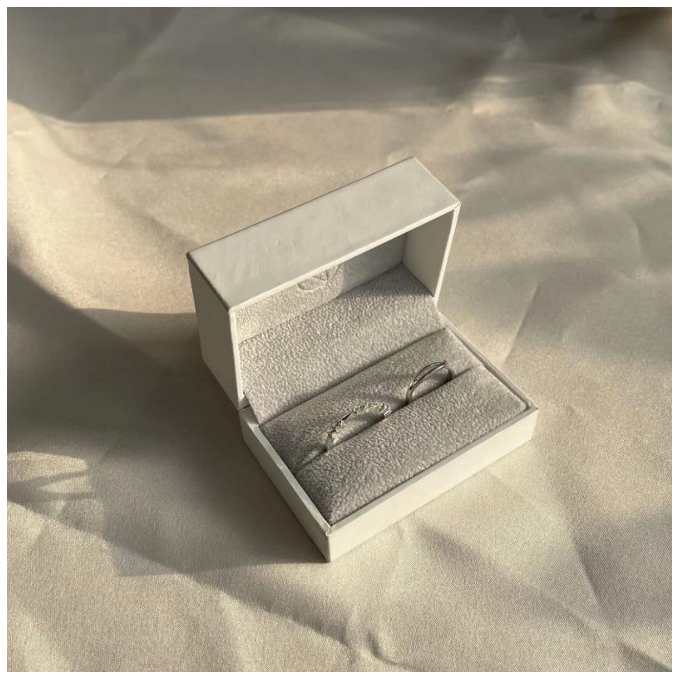
Other products that may interest you: