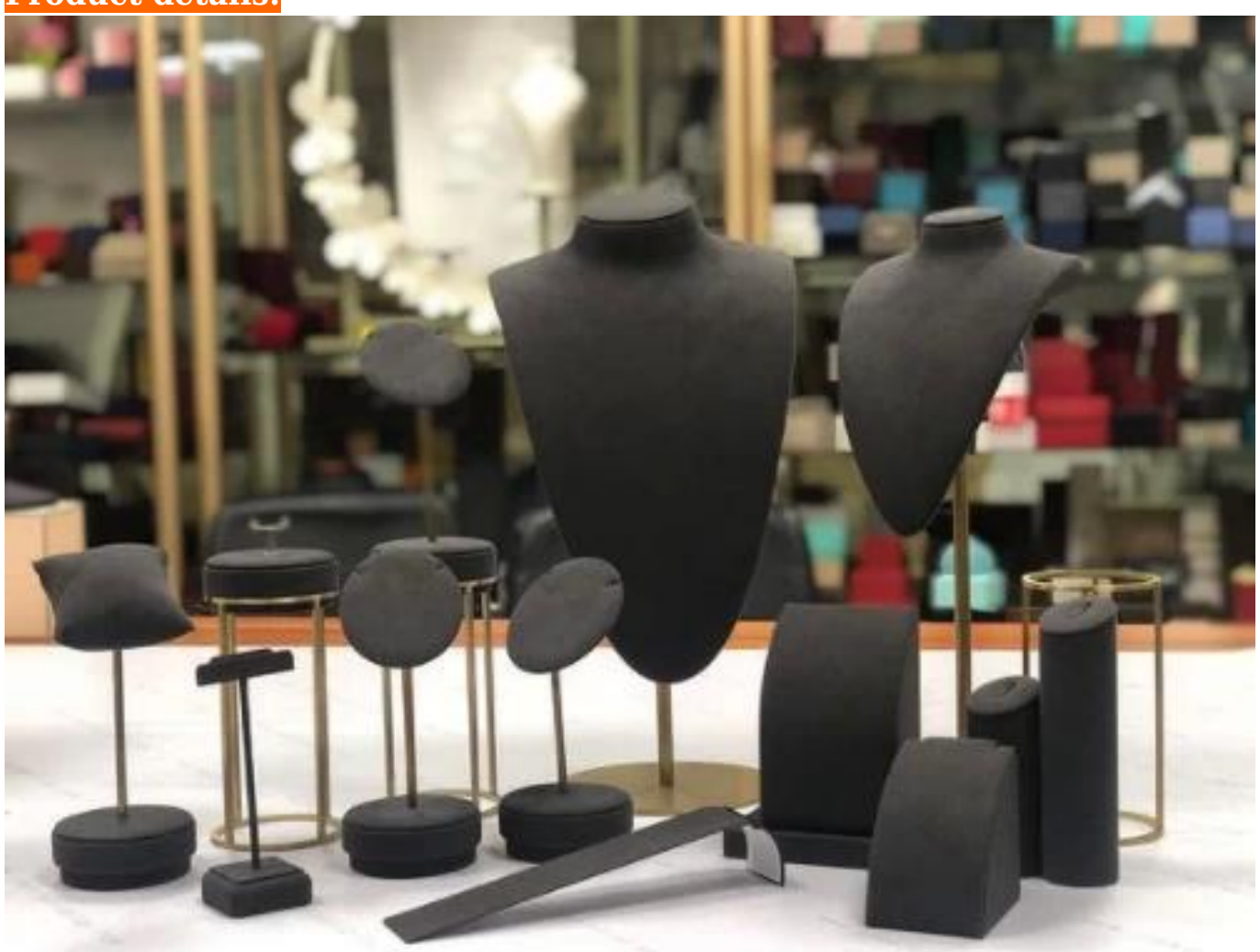
Other products that may interest you: