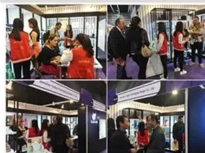
2018 Hongkong international jewellery show