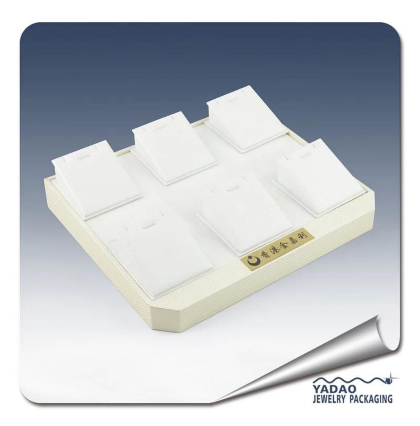
Other products you may interested in: