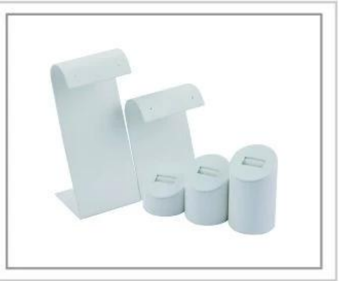
Jewelry Display Stands