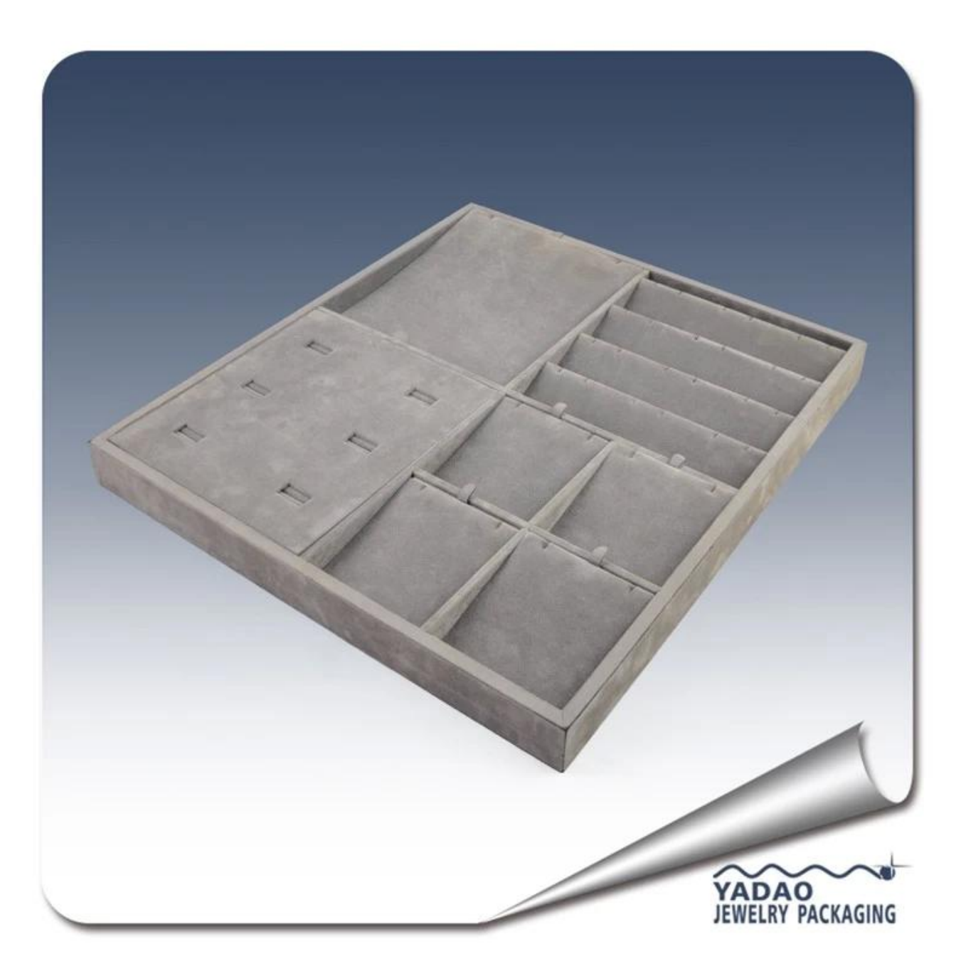
Other products you may interested in: