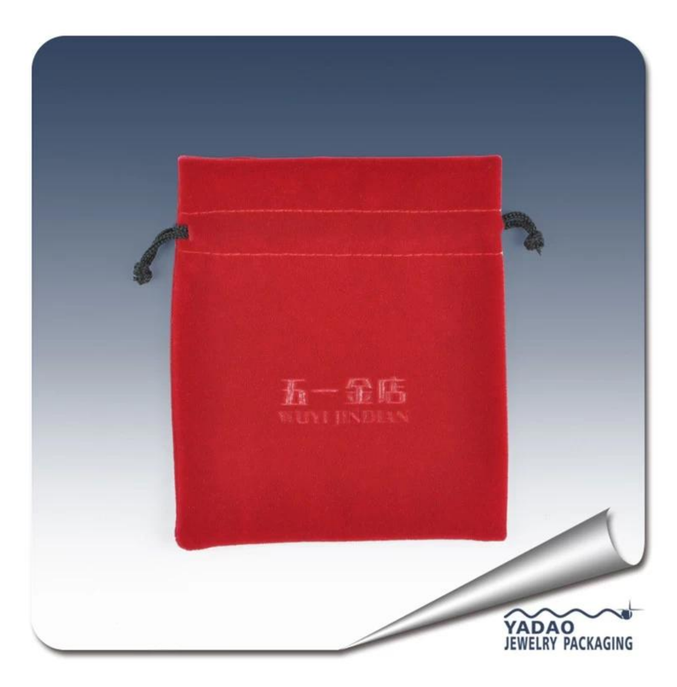
Other products you may interested in: