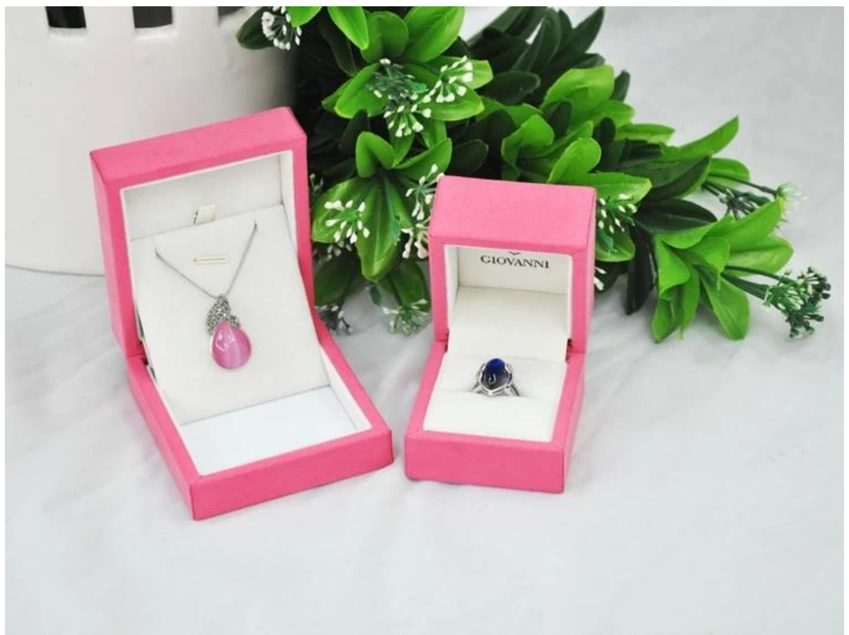
Other products you may interested in: