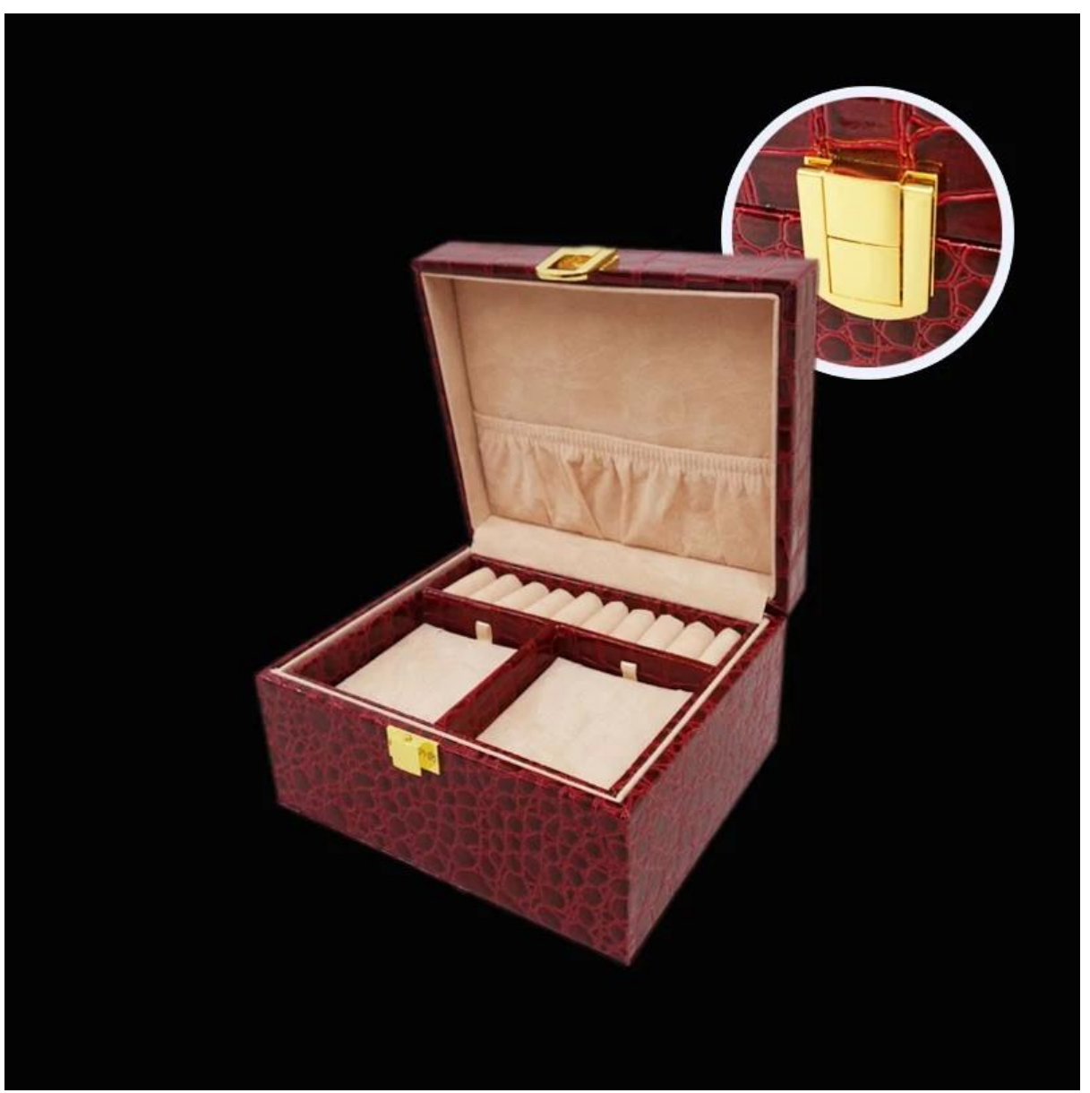
Other products you may interested in: