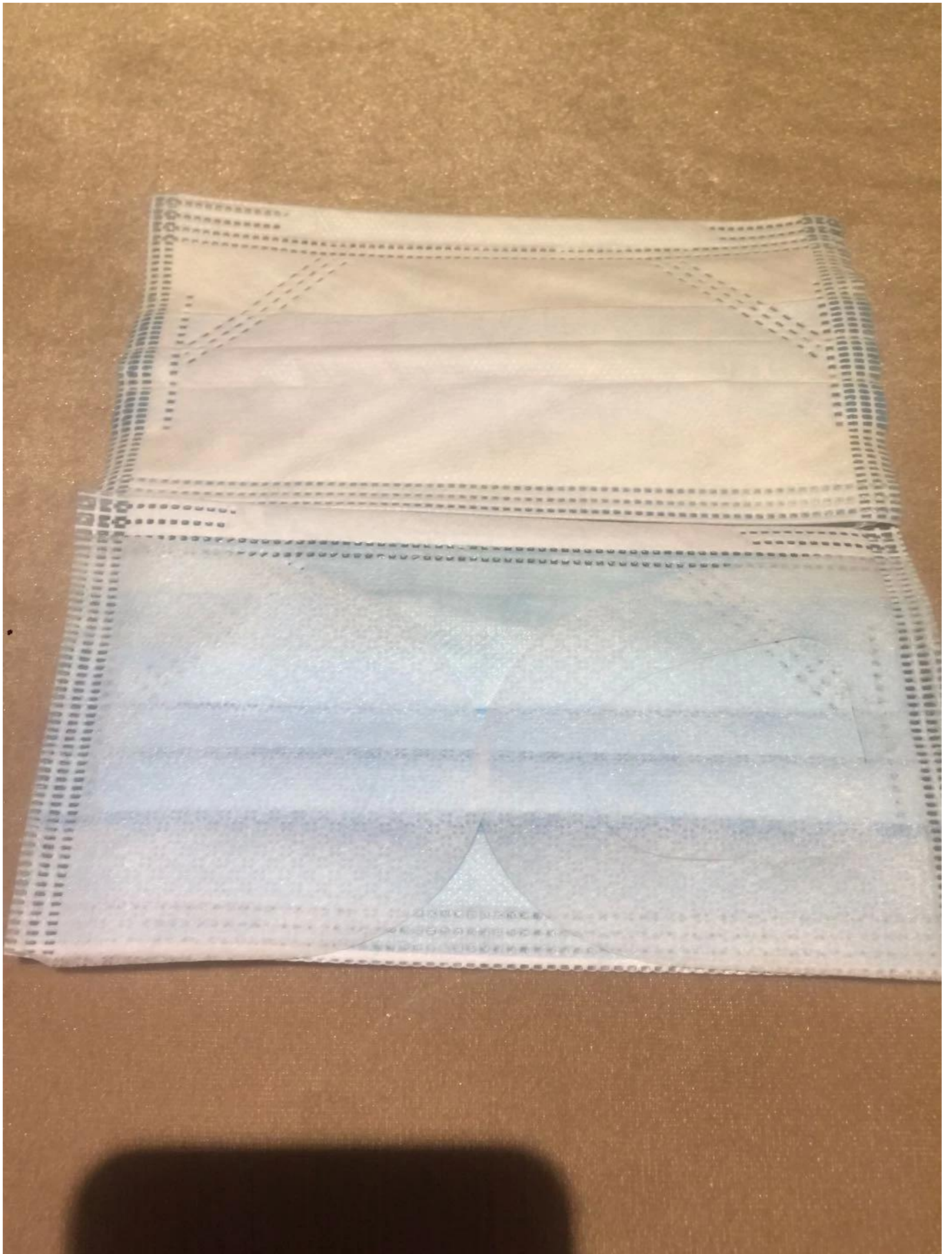
earloop non woven medical 3 ply disposable FFP3 surgical face coronavirus mask