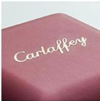
metal logo sticker