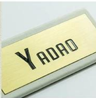
metal logo plate