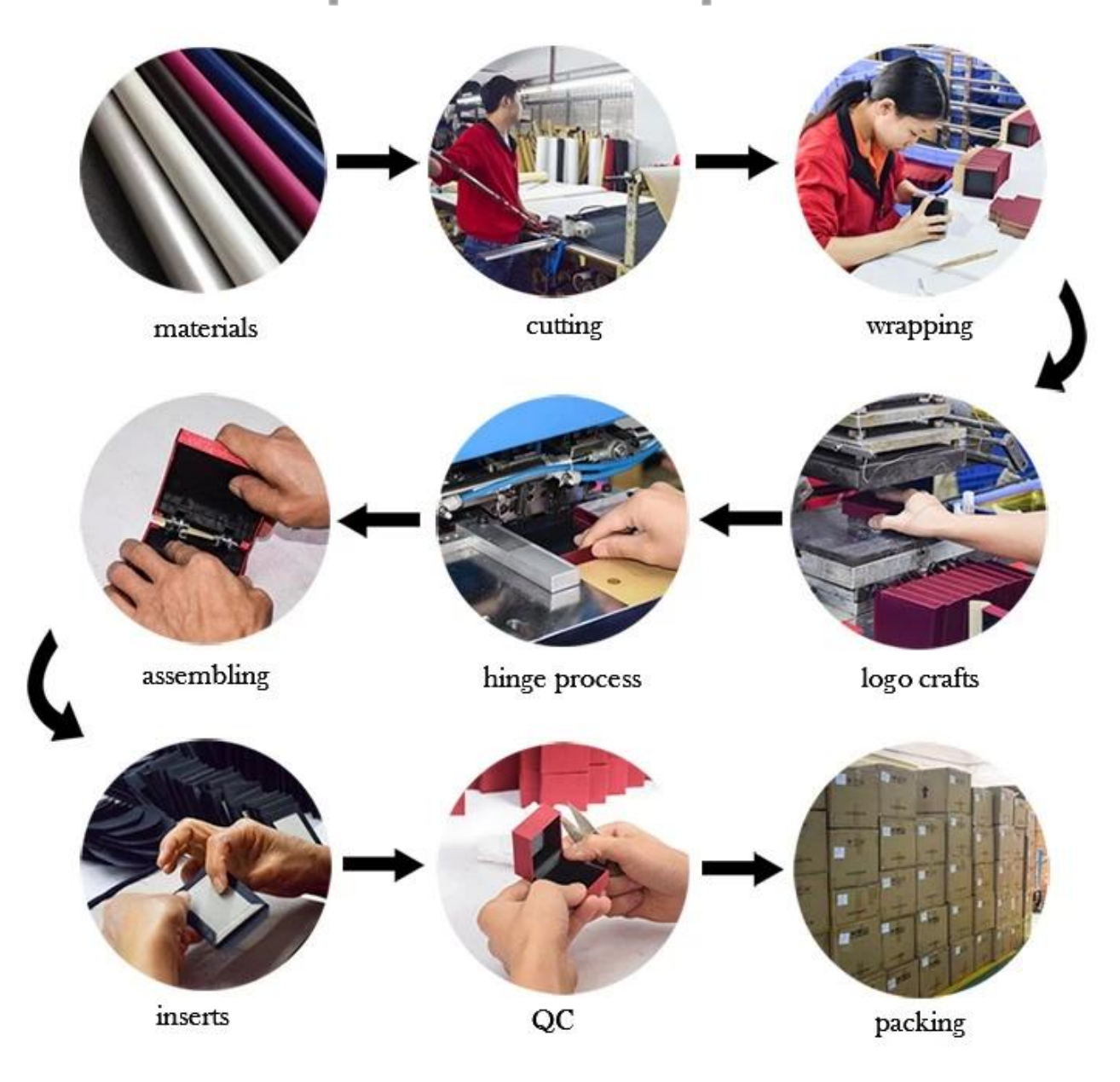
Packaging and delivery \square