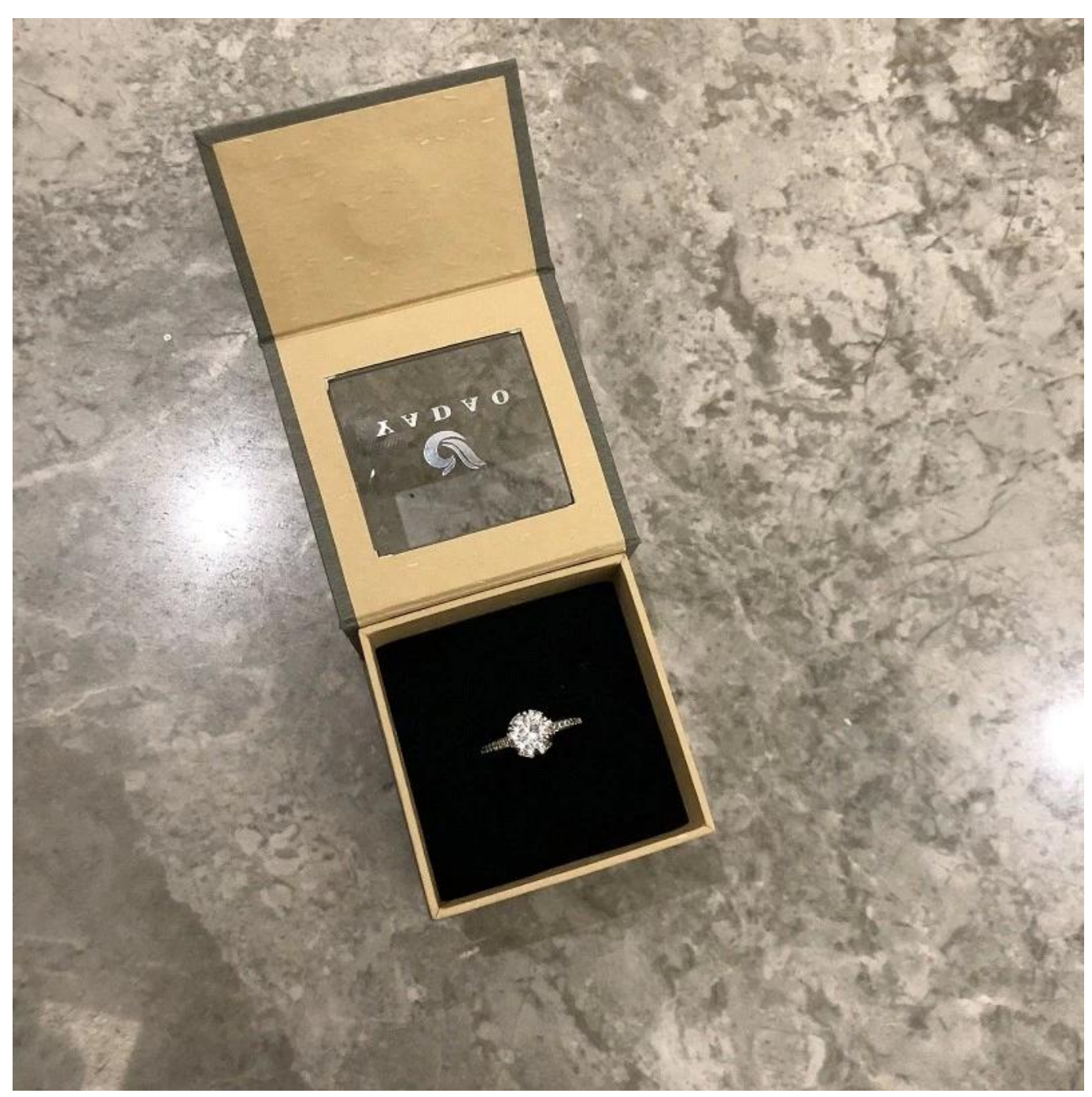
Other products that may interest you: