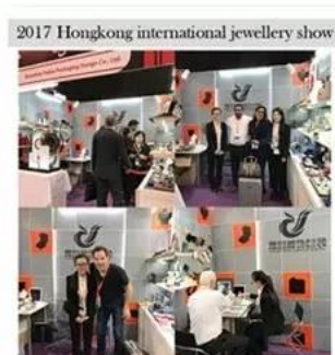
2017 Hongkong international jewellery show