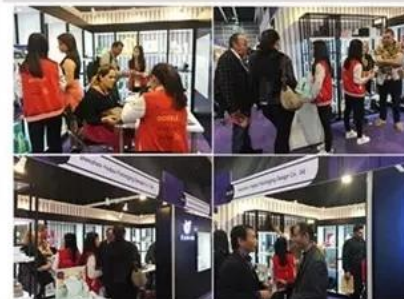
2018 Hongkong international jewellery show