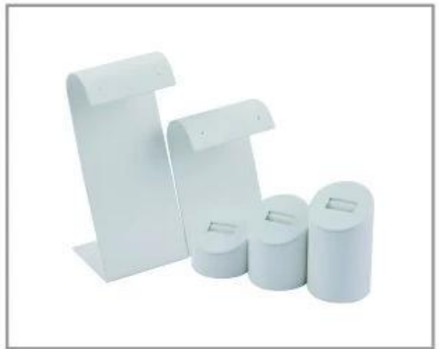
Jewelry Display Stands