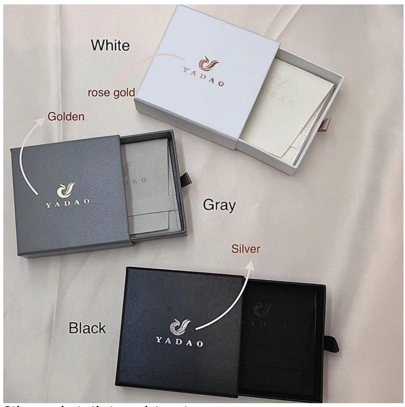
Other products that may interest you: