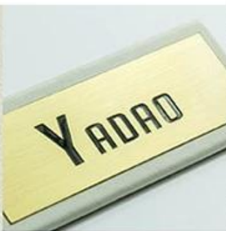
metal logo plate