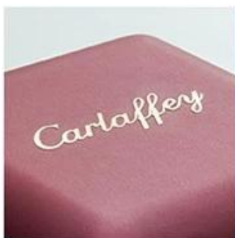
metal logo sticker