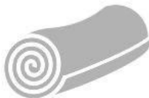
Jewelry Roll bag