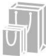
Jewelry paper bag