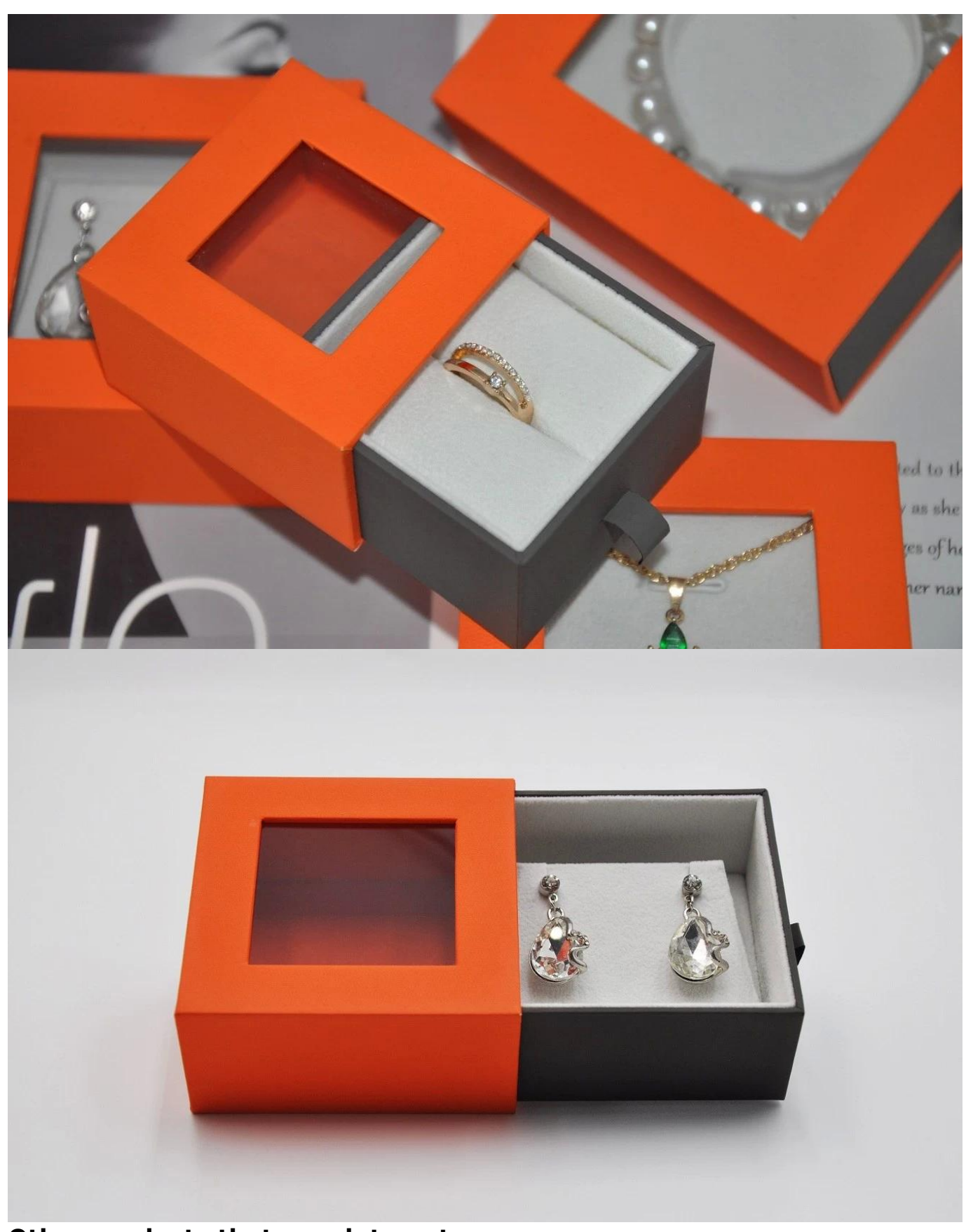
Other products that may interest you: