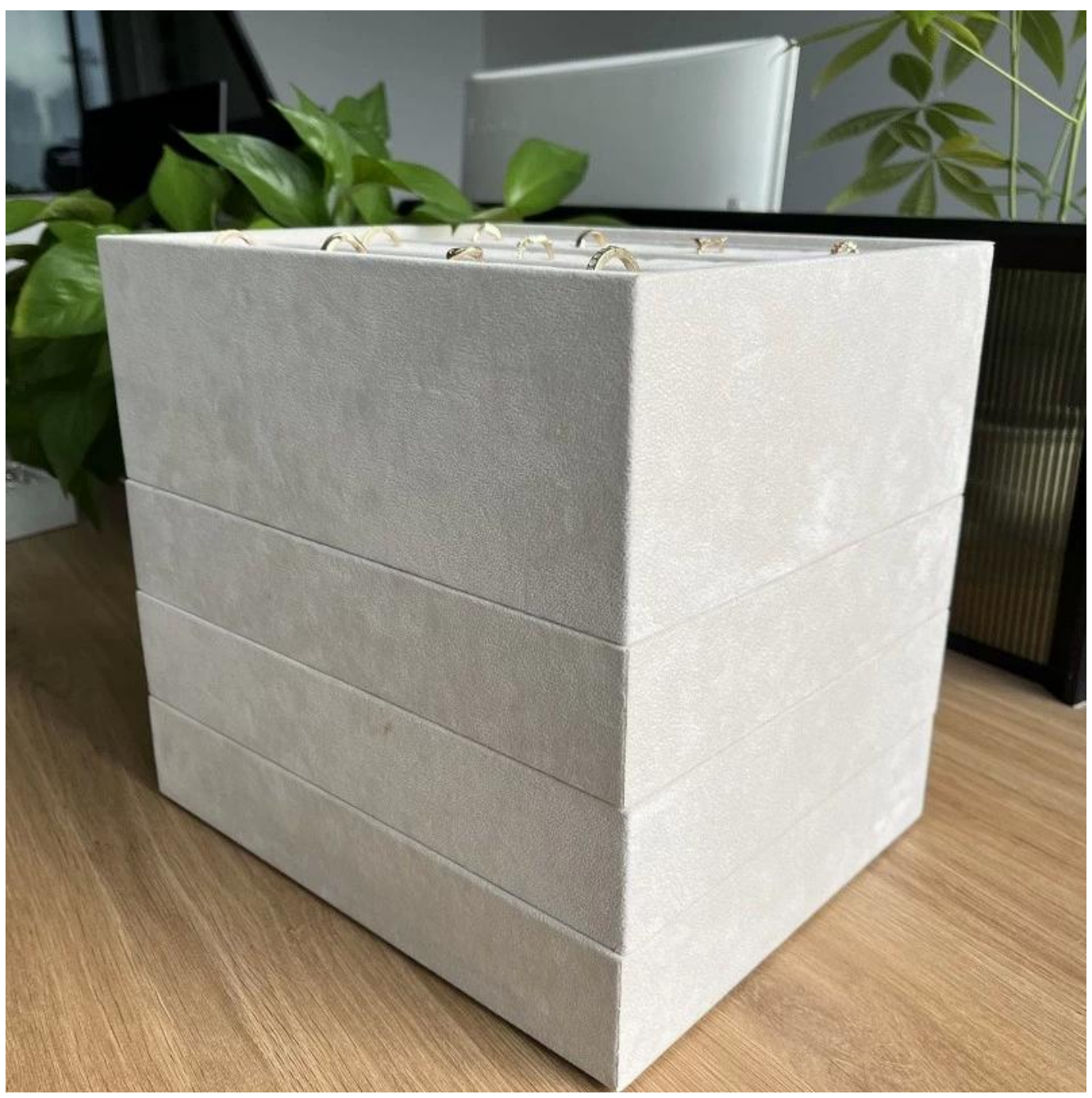
Other products that may interest you: