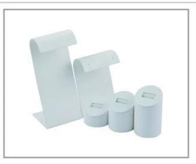
Jewelry Display Stands