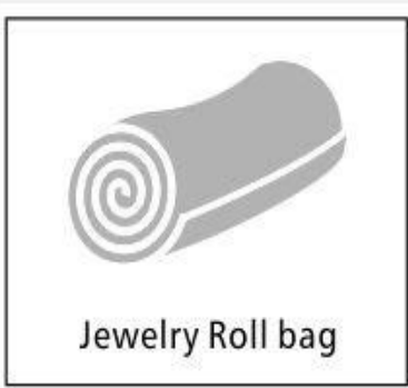
Jewelry Roll bag