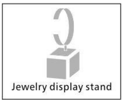
Jewelry display stand