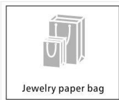
Jewelry paper bag