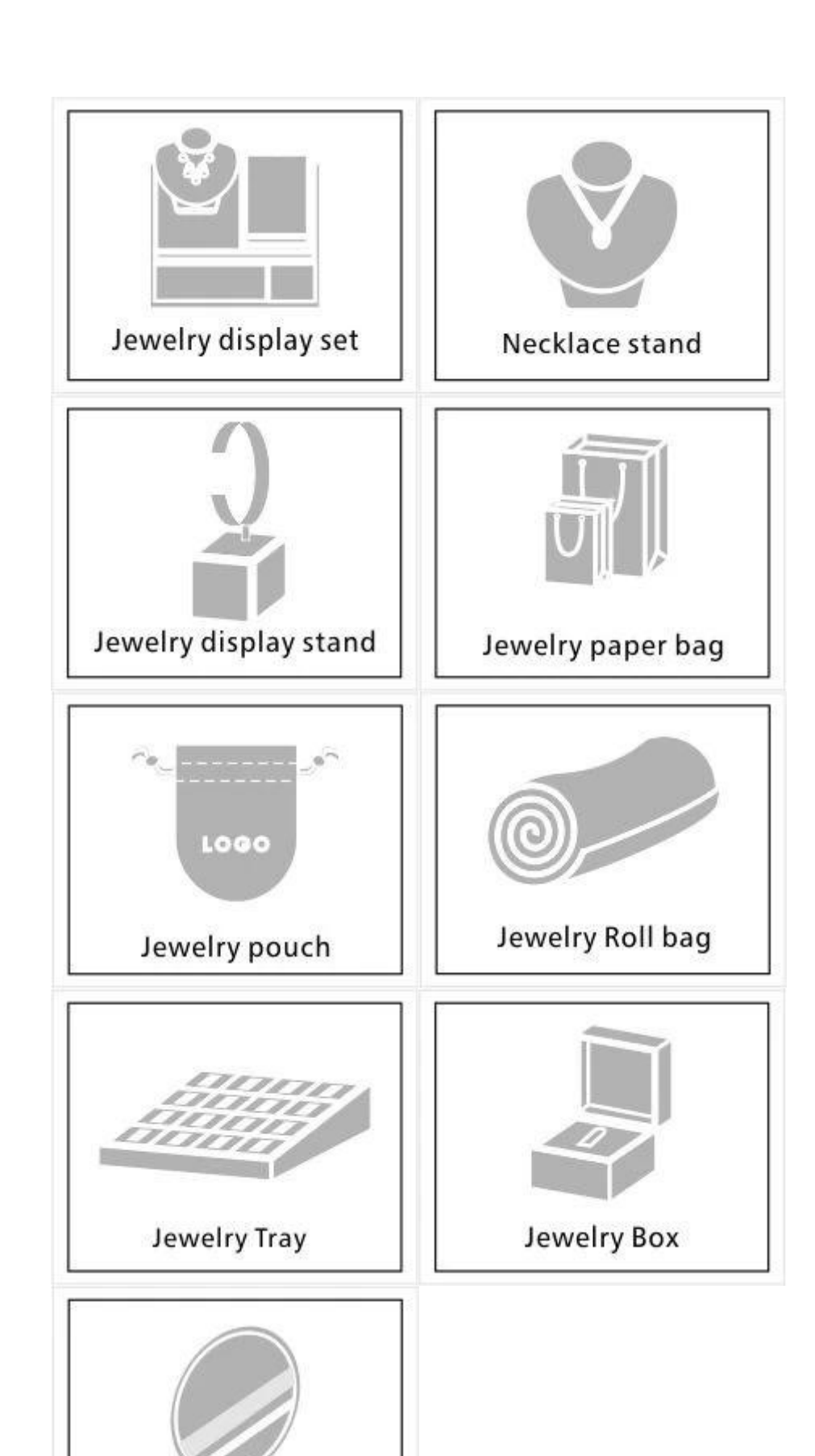
Environment \\ \\ \\ \\ \\ \\