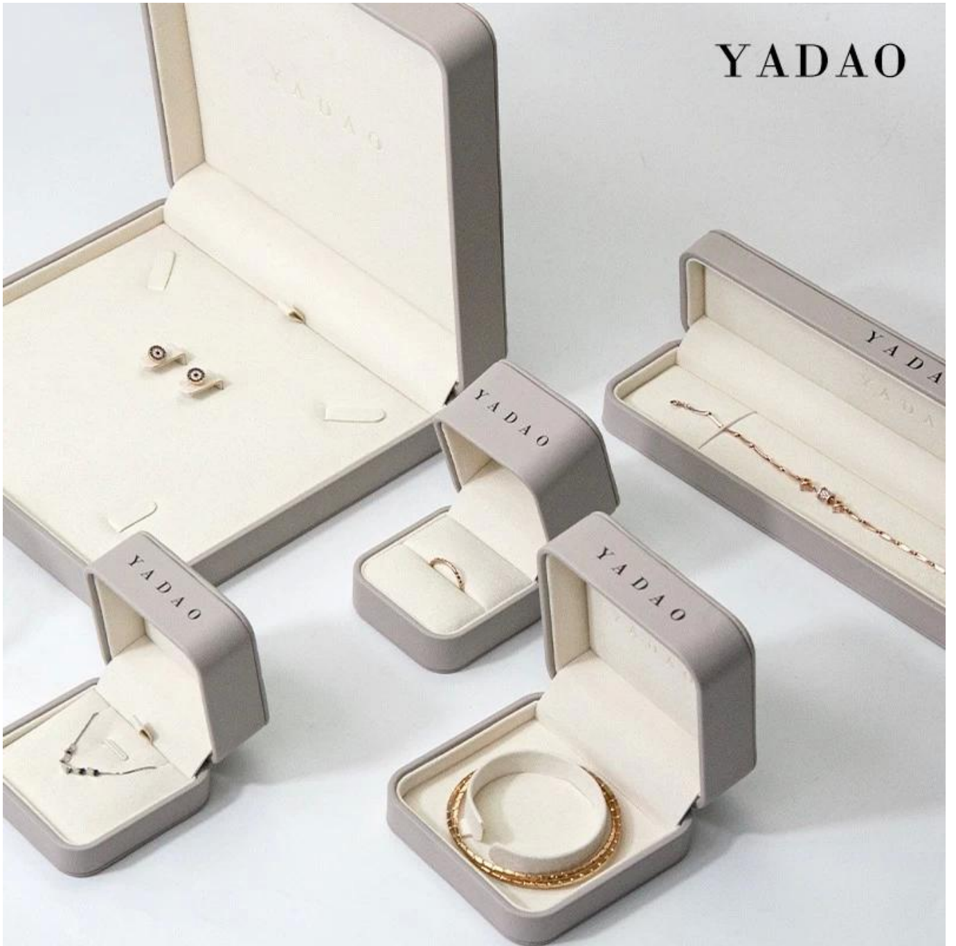
□ Yadao's office □