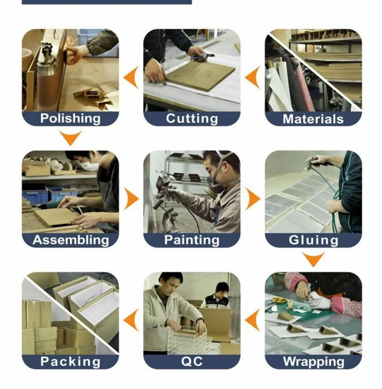
Packaging & Delivery □