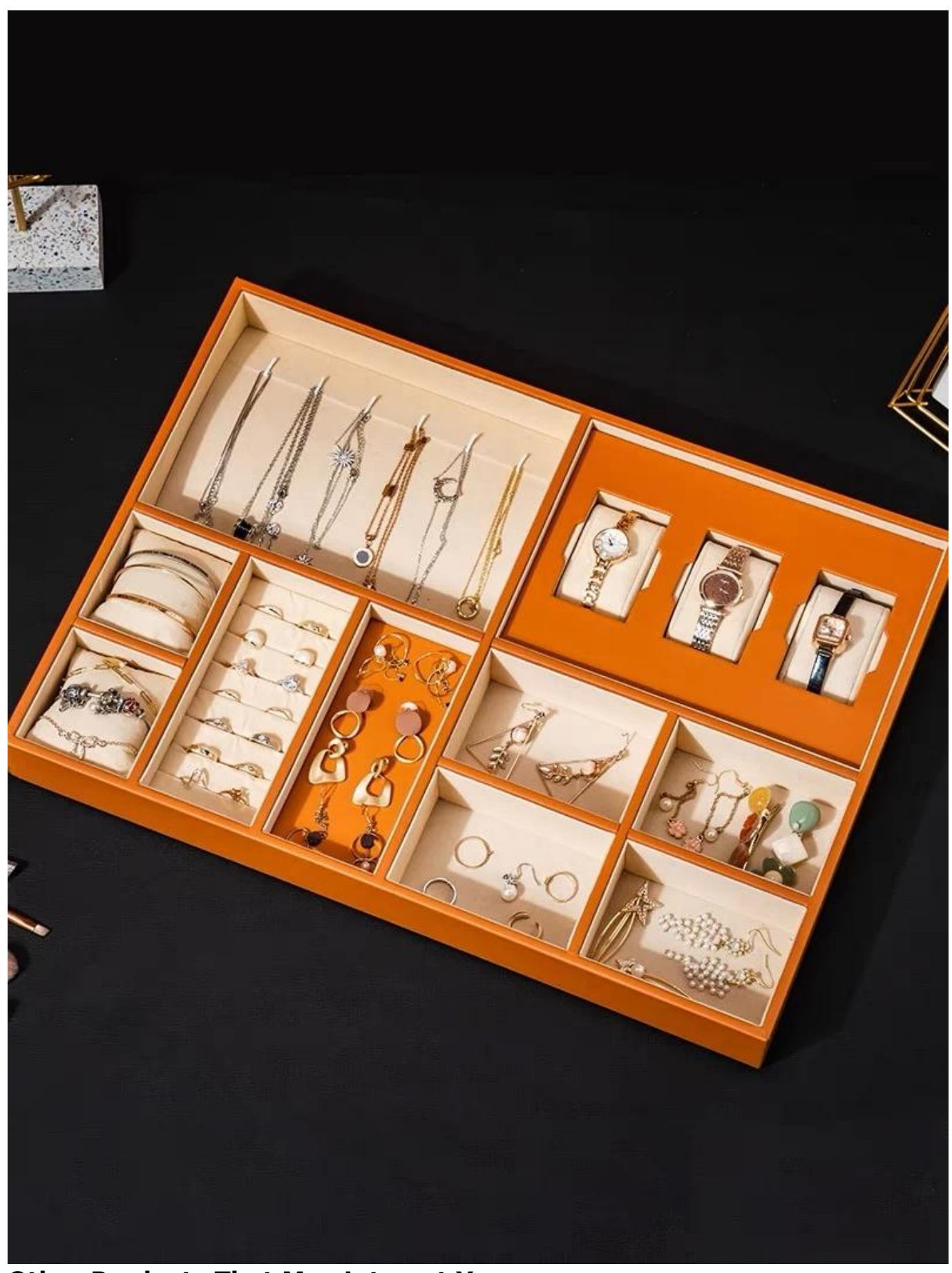
Other Products That May Interest You: