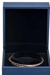
bangle box: 9*9*4