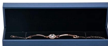
bracelet box: 22*5.5*3.3