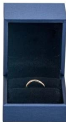
ring box: 6*6.5*5.1