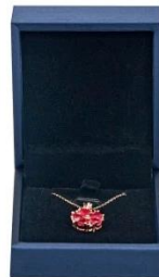
pendant box: 7.4*8.4*3.6