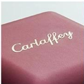
metal logo sticker