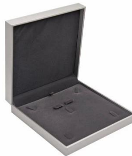
set box: 19*19*4.5