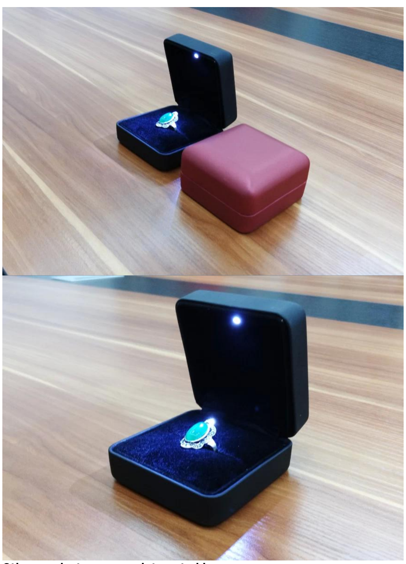
Other products you may interested in: