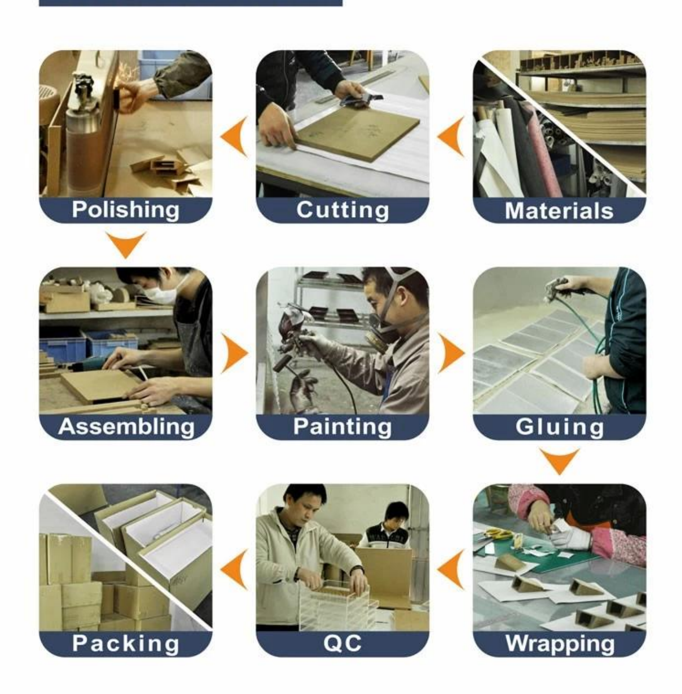
Packaging & Delivery □