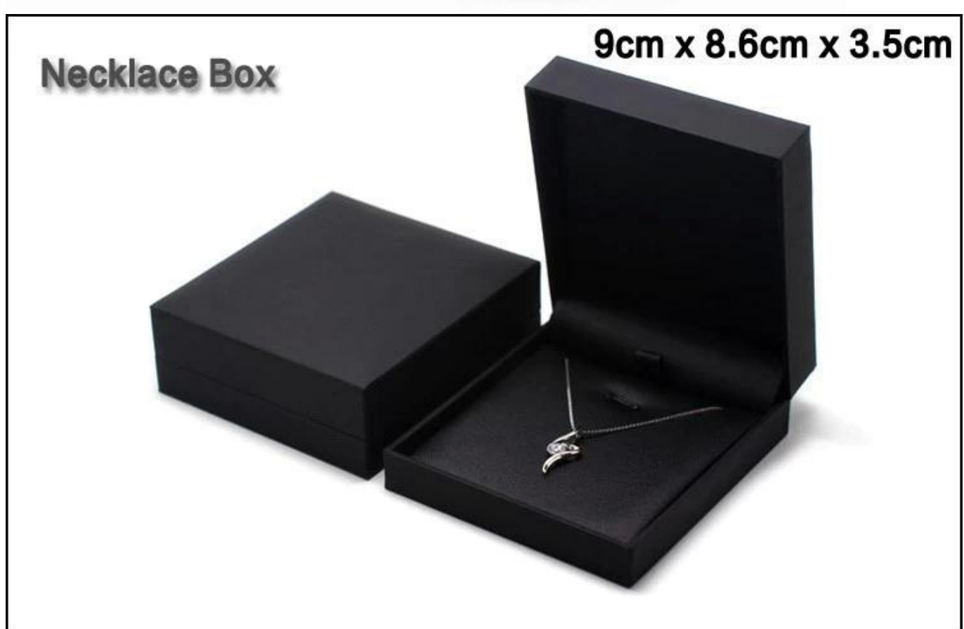
Other products you may interested in: