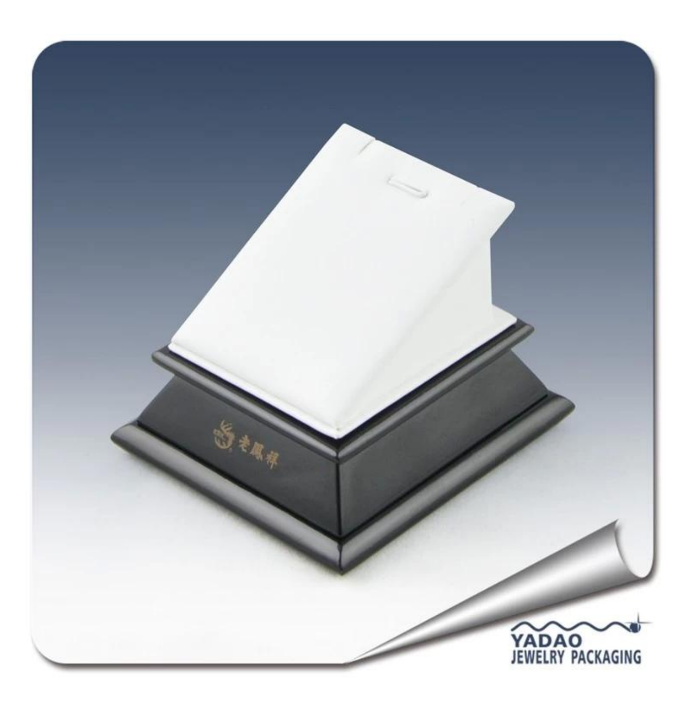
Other products you may interested in: