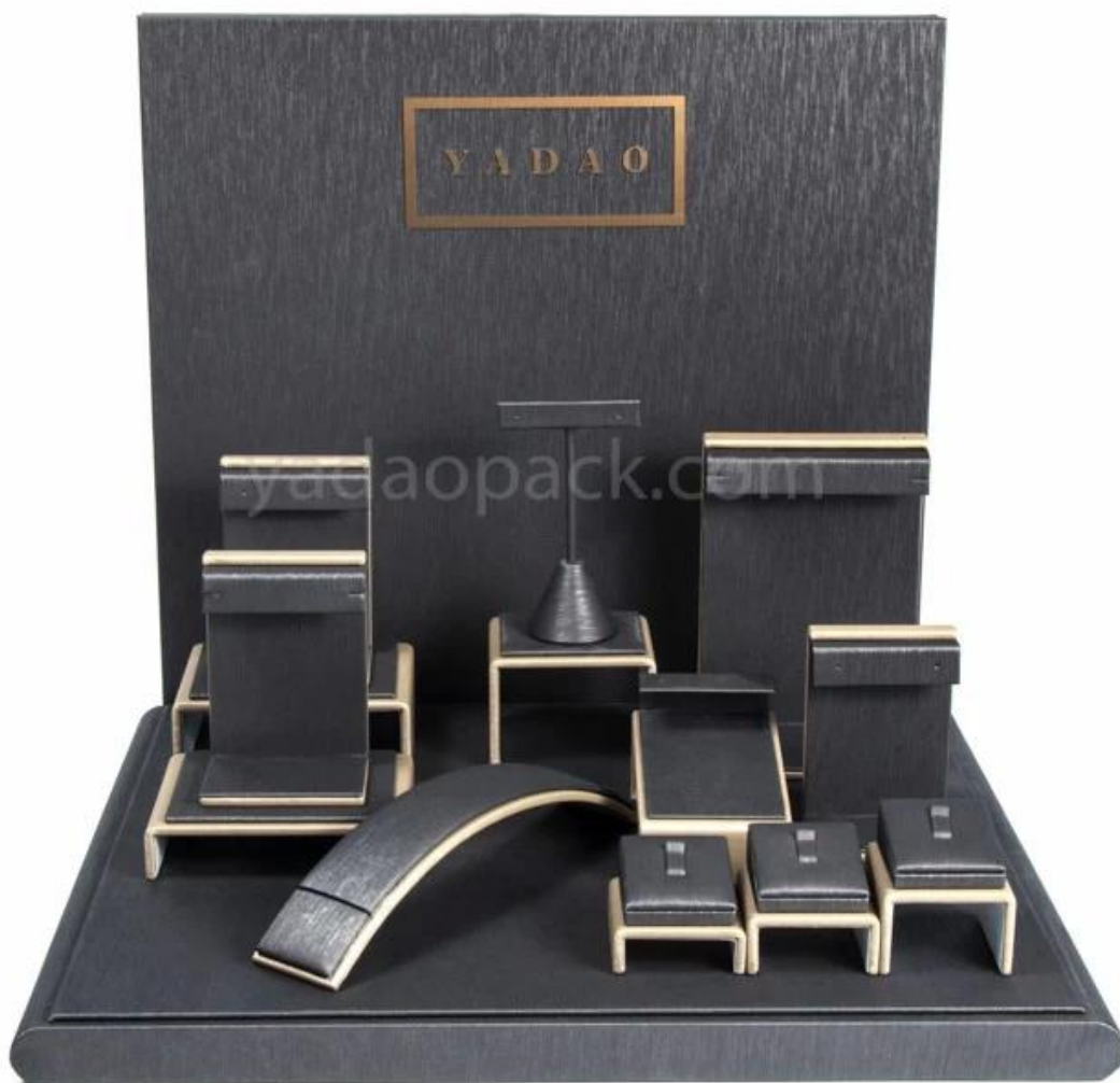
Custom White High-Gross Gold Brushed Metal with Marbled PU Leather Jewelry Display Stand